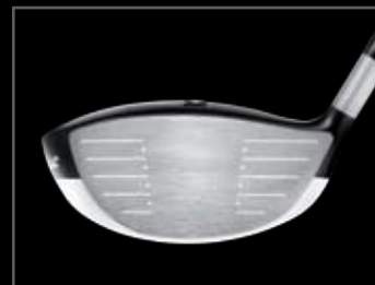
LARGE HITTING AREA

A full pear profile, 460cc, high performance titanium driver that produces mid launch with low to mid spin.