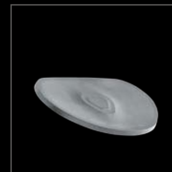
INTERNALLY MILLED FACE INSERT